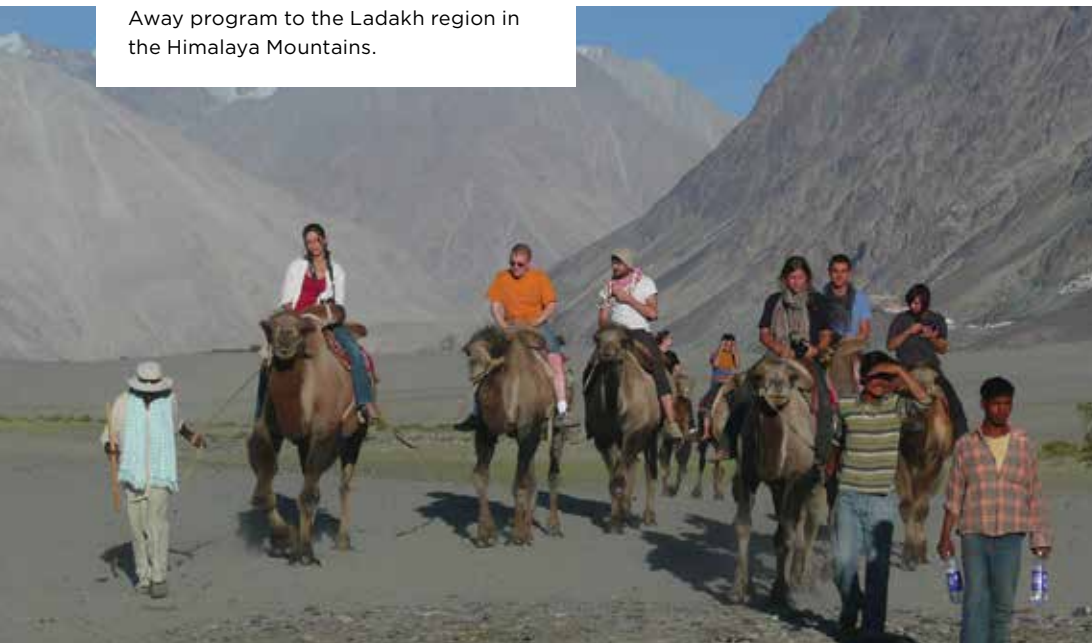
India: Ancient Culture in Modern Times is a popular Corcoran-sponsored Study Away program to the Ladakh region in the Himalaya Mountains.

Alumni of the program are prepared to pursue careers in museums of art, history, natural history, and science; children's museums; and private design firms across the country.