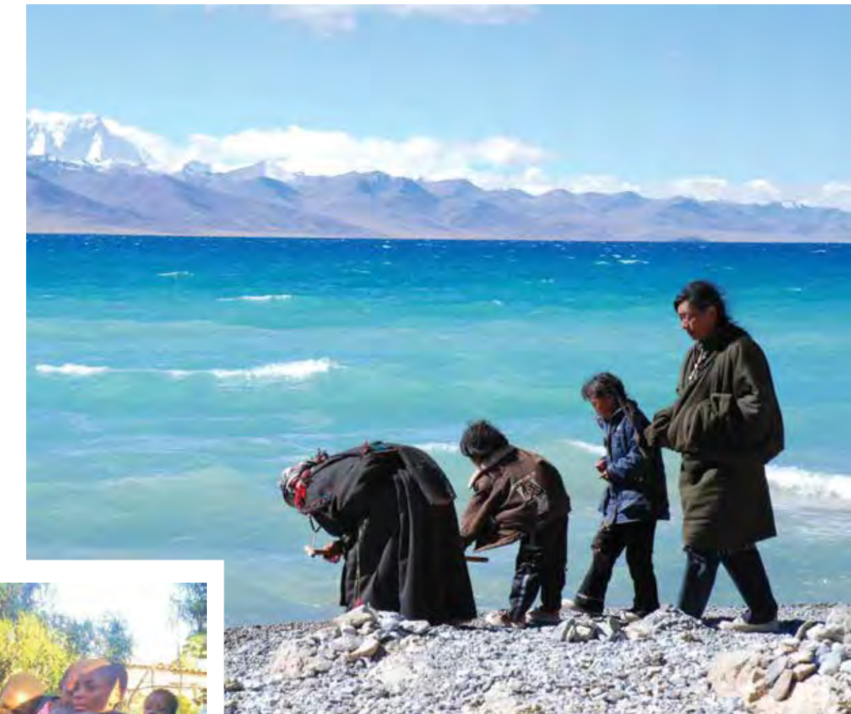
Above left to right: from thesis "The Road Home."