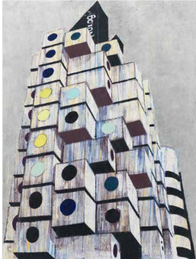
14 Nakagin Capsule Tower, Tokyo, 2009. Oil on canvas, 80 x 60 in.