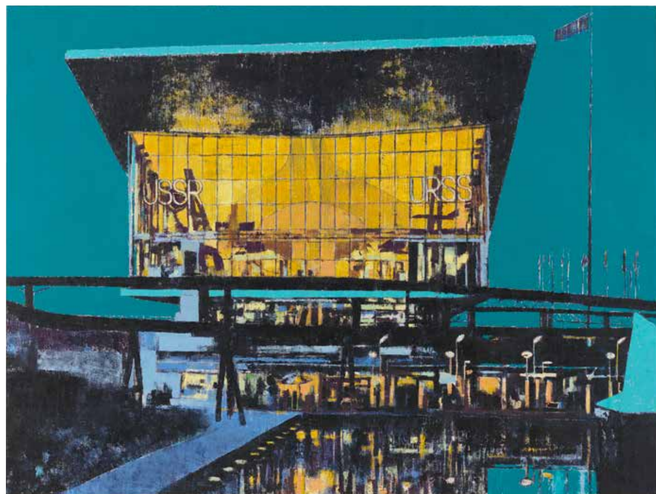
13 Pavilion of the Soviet Union, Expo 67, 2009 . Oil on canvas, 60 x 80 in.