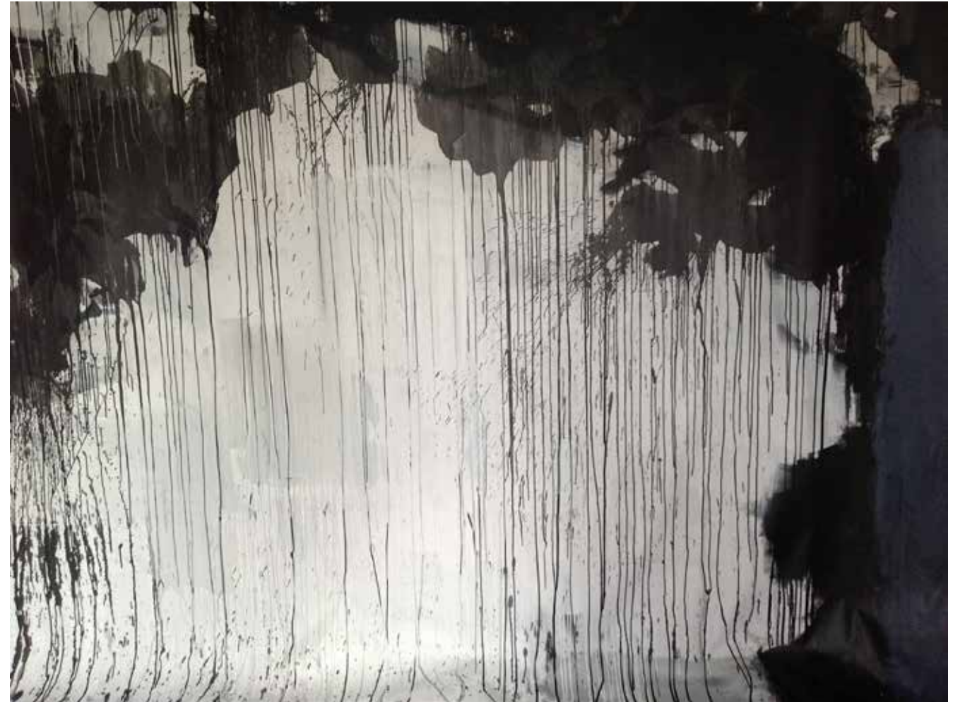
10 Watergate, Washington, D.C., June 2012, 2012 (detail) . Oil and acrylic on synthetic canvas, two paintings, each 163 x 624 in.

Although Perez's architectural portraits are always depicted up-close, Watergate is an immersive, consuming work, consisting of two paintings 13½ feet high and 52 feet across. Stretching across the gallery's rounded walls, the painting is a cloud of swooping curves and jaunty angles, made stark with a palette of blacks, whites, and greys. The paint, pressed and dripped onto the printed photograph, has the effect of literally obscuring the building's facade, famous from countless photographs and newsreels documenting the political scandal that took its name. White and grey blocks of paint hover on top of the building's image, echoing the structure's windows but not conforming to them, miming the print medium through hand-applied brushwork. Black brushstrokes gather to form masses of foliage and then break free, dripping to the