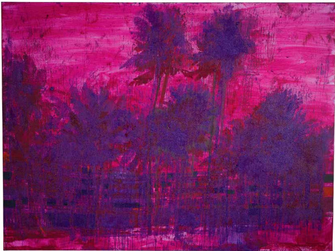
12 Dorado Hilton Hotel, Puerto Rico, September 2010 . Oil on canvas, 60 x 80 in.