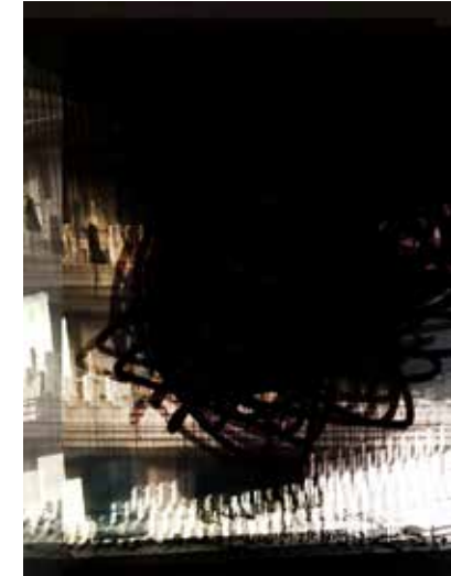
2-5 Watergate, Washington, D.C., June 2012, related drawings, 2012