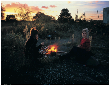
Tom Hunter (British, b. 1965) The Vale of Rest, 2000 cibachrome print, 53 x 65 1/4 inches Gift of The Heather and Tony Podesta Collection, Washington, DC