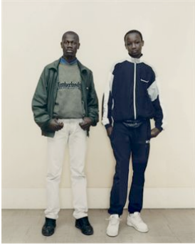
Rineke Dijkstra (Dutch, b. 1959) Lycee Hector Guimard, Paris, January 11, 2001 color coupler print, 59 1/2 x 49 3/4 x 1 1/2 inches Gift of The Heather and Tony Podesta Collection, Washington, DC