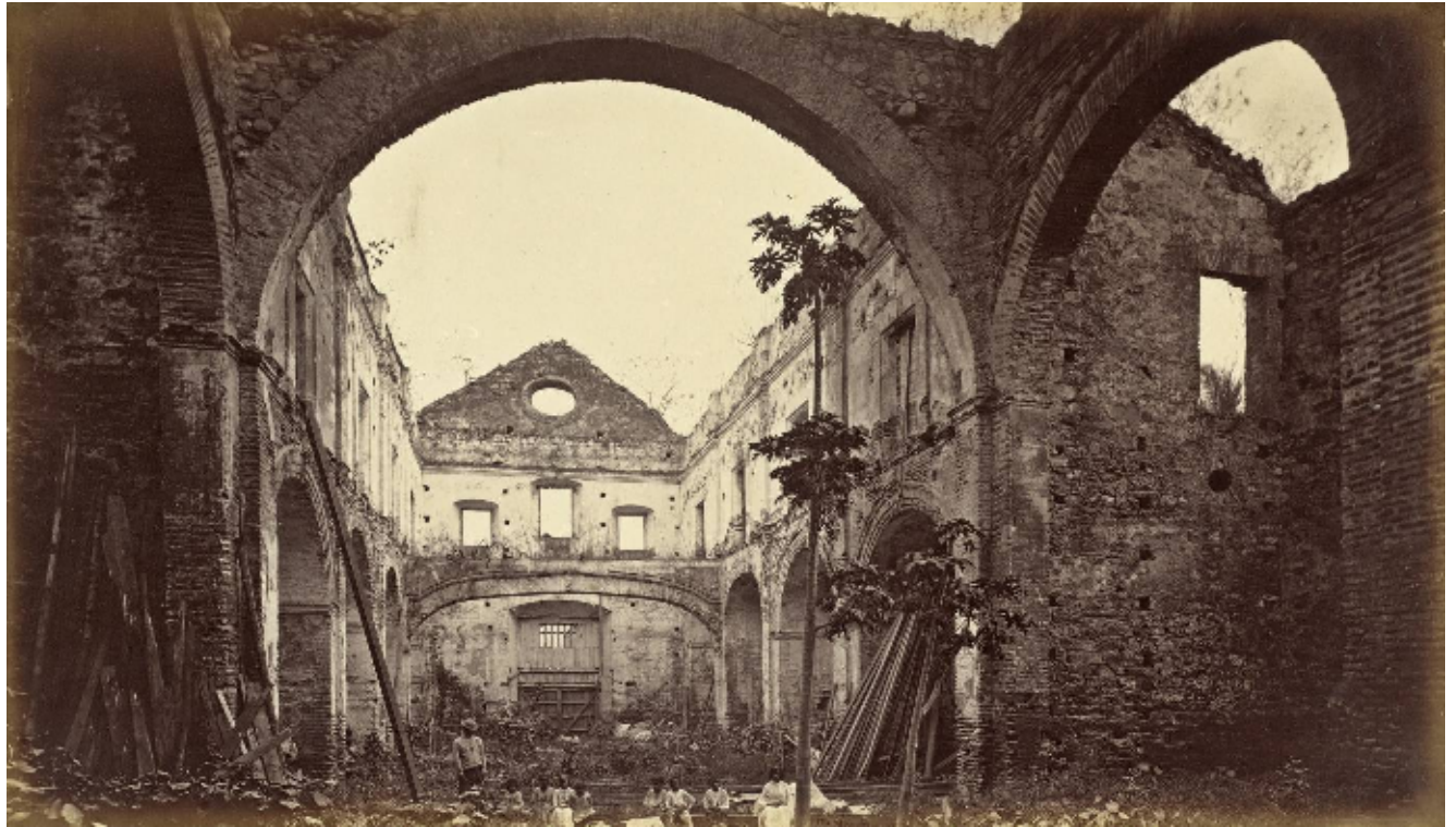
Eadweard Muybridge, Ruins of the Church of San Domingo, Panama , 1875. Albumen silver print. 5 1/4 x 9 1/4 inches. Gift of Mitchell and Nancy Steir, Image courtesy of the Board of Trustees, National Gallery of Art, Washington.